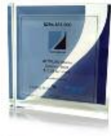
Square / Rectangle