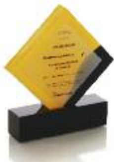
Cut plexi back